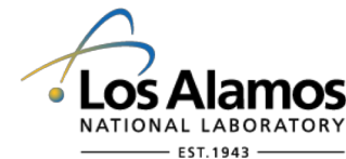
Los Alamos National Laboratory (w/ Flex Template)